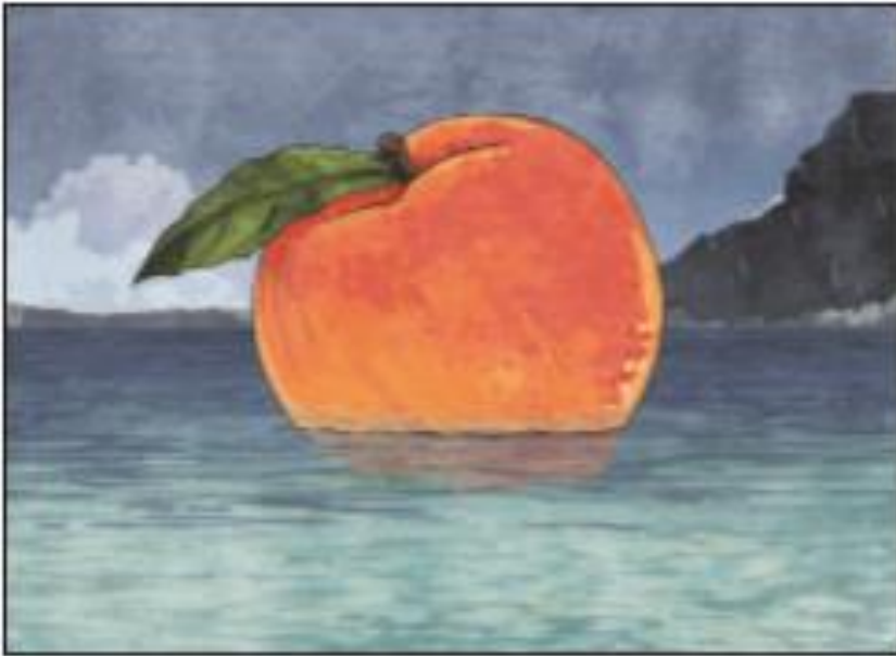
The peach at sea.

Amazingly, nobody else lost their lives during the perilous incident and the death of the unpopular sisters from Hilltop House is unlikely to cause anyone much distress. However, police are concerned for the safety of the sisters' nephew. James Trotter has not been seen since Tuesday. The public are urged to report any sightings of him immediately.