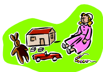
Table Top Sale – Sunday 17 April 12.30pm – 4pm at the Sports Pavilion. Toys, games and much more. Please come along and give your support